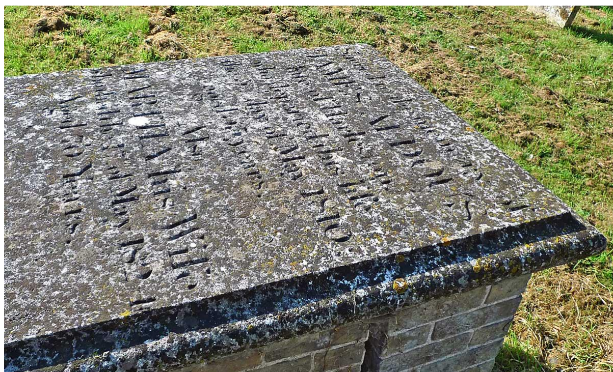
Aldous vault-tomb viewed from the other (north) side