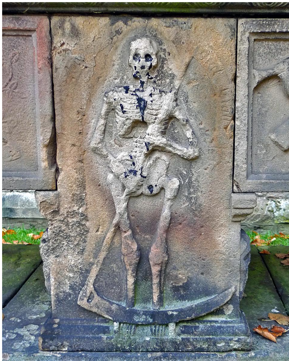
Nothing to do with the Proctors, but we could not leave Barnard Castle without including this wonderful grim reaper panel from the table monument tomb (near the church's south-west door) of George Hopper, who died in 1725 aged 23 years. There is a page on the beautiful Barnard Castle area in preparation.