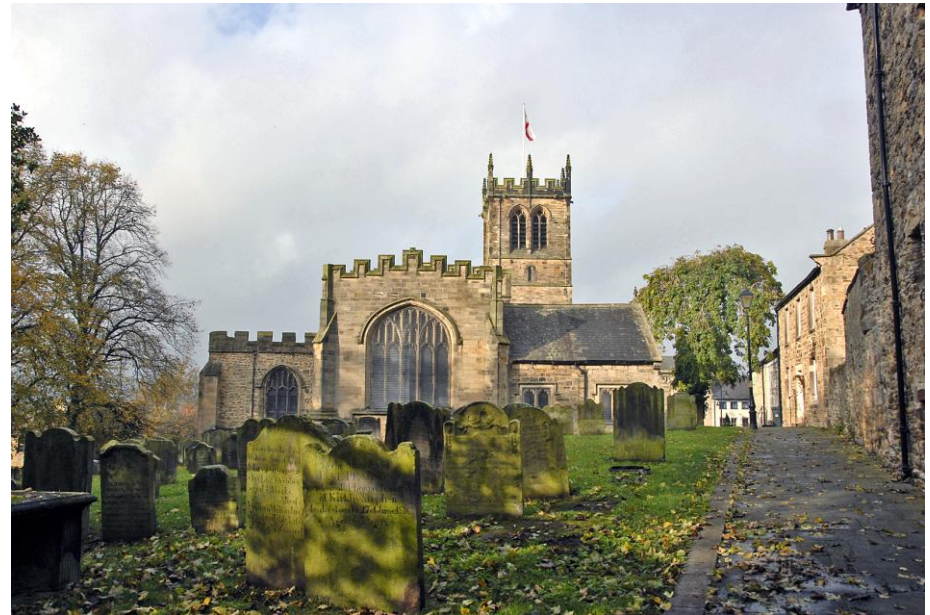
The parish church of St Mary, Barnard Castle