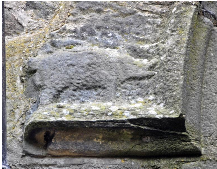
Richard III (1452 – 1483 – 1485 (32)) was Lord of Barnard Castle 1477 – 1485 and left his boar chop behind on the church wall.